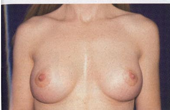
A successful augmentation, before and after.

having silicone available would be an advantage for patients.