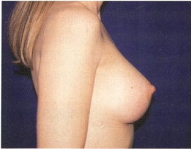
Some augmentations address shape as well as size, as seen in these before and after photos.

shrink wrap—it's an immediate release of the problem." Implants can break, but it doesn't happen often. If it does, the body will absorb the saline and the manufacturer will replace the implant.